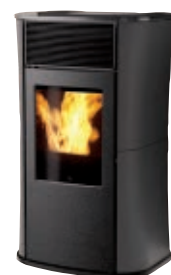
Açero, Cristal gris Ατσάλι γκρι Steel and dark grey glass