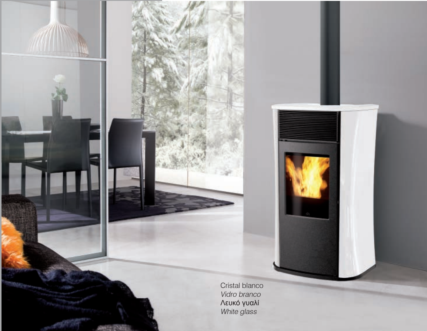
Cristal blanco Vidro branco Λευκό γυαλί White glass