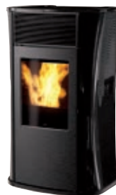
Cristal negro Vidro negro Μαύρο γυαλί Black glass