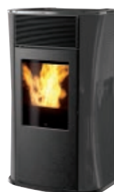
Cristal gris Vidro cinzento Γυαλί γκρι Grey glass